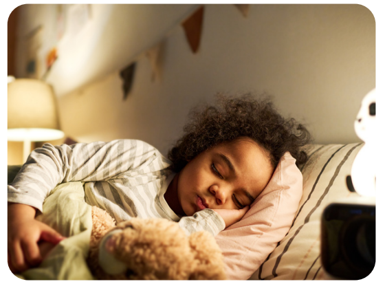
We're making improvements to our system, so you can power through your day and sleep tight at night.

These system updates are part of our commitment to provide continued safe, reliable and efficient energy delivery to your home or business.