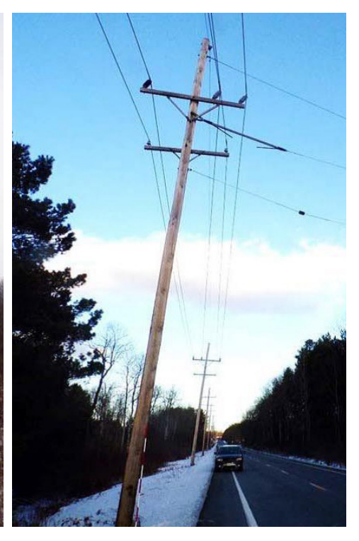
Field assessments and structural analysis conducted in February 2019 in support of the rebuild project