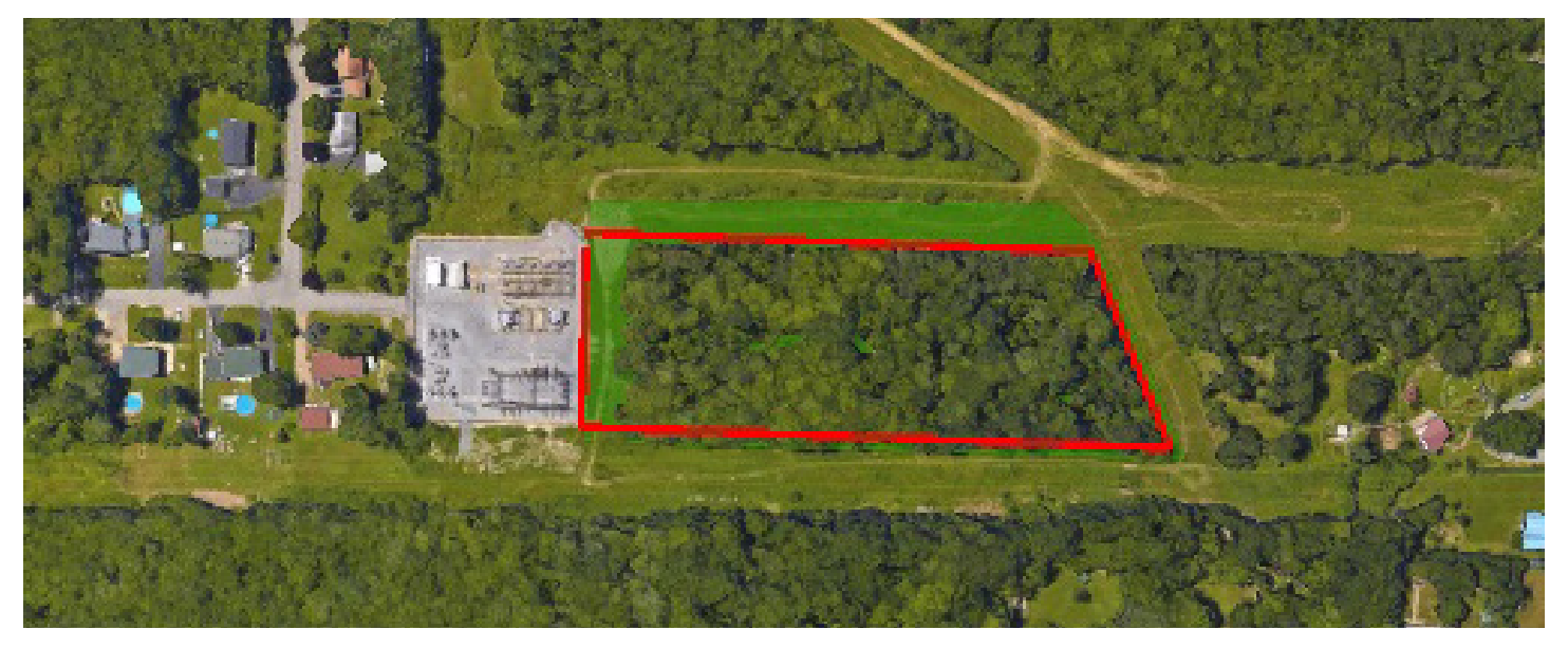
Proposed expansion at Big Tree Substation in Orchard Park.