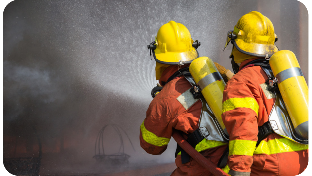
In 2021, we trained more than 800 fire department members across New York state in person.

All training identifies the responsibilities, hazards, precautions, safety zones, and the role of each agency, and how to integrate and coordinate each agency's response effectively and safely.