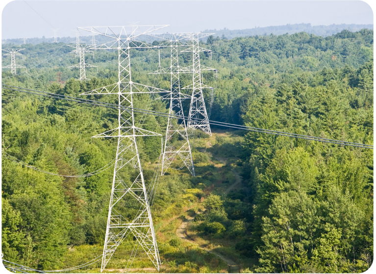
Our "eye in the sky" covers some of the most remote areas in our service territory, giving us the necessary information to make repairs quickly and efficiently.

Drones have become one of the many innovative tools we use to quickly and efficiently perform inspections of substations and transformers. Drones allow us to safely scan and evaluate large areas of our system while it is still energized. We can identify issues and resources needed for maintenance or repair, and perform the work safely in a shorter period of time.