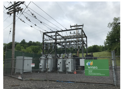
Java Microgrid Project

The substation in Java was identified for the pilot project because it has a single transformer and a single transmission line therefore lacks backup should an outage occur. This new energy storage facility will provide backup power for up to 8 hours, so we can continue serving our customers when we need to make repairs to the system.