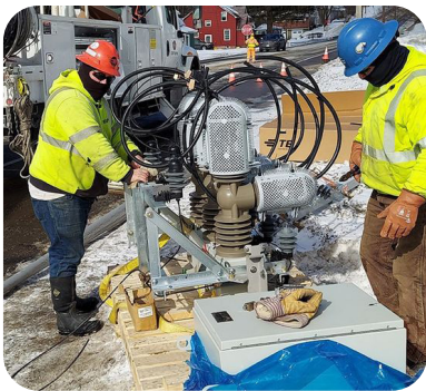
Circuit upgrades, including the one pictured above, increase reliability to our customers.

You can count on us to continue making investments in our system so you can power your days for years to come.